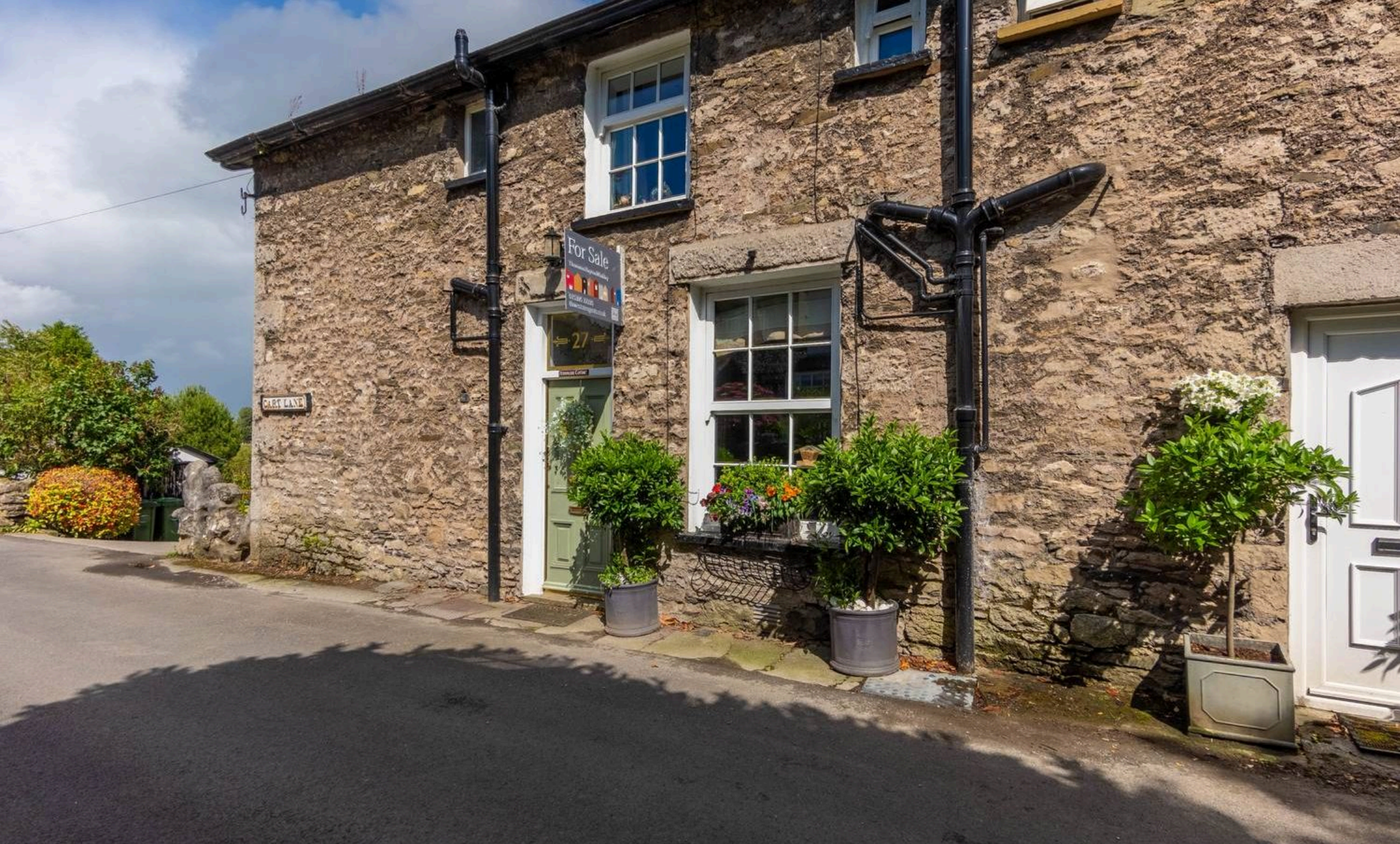
27 Cart Lane, Grange-Over-Sands £320,000