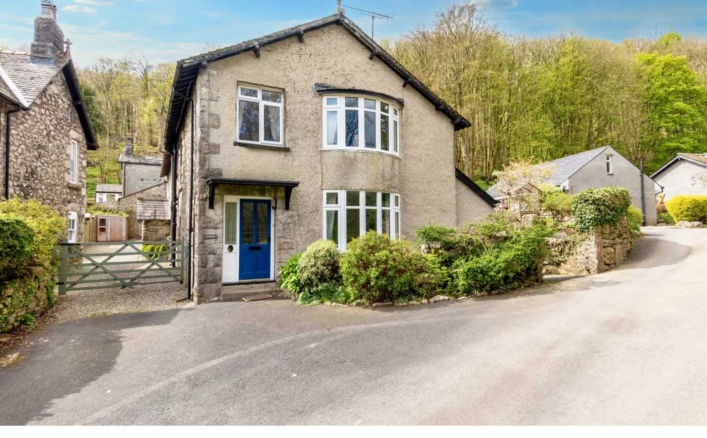
Lynboro Windermere Road, Grange-Over-Sands £495,000