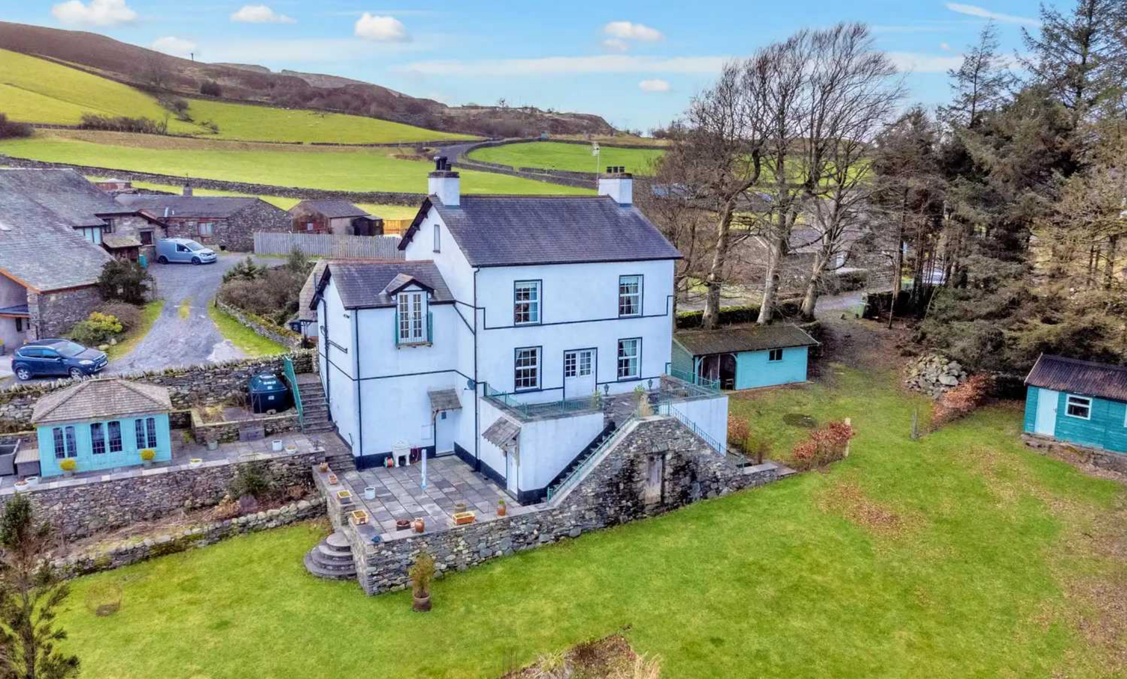
Gawthwaite Farm, Gawthwaite £750,000