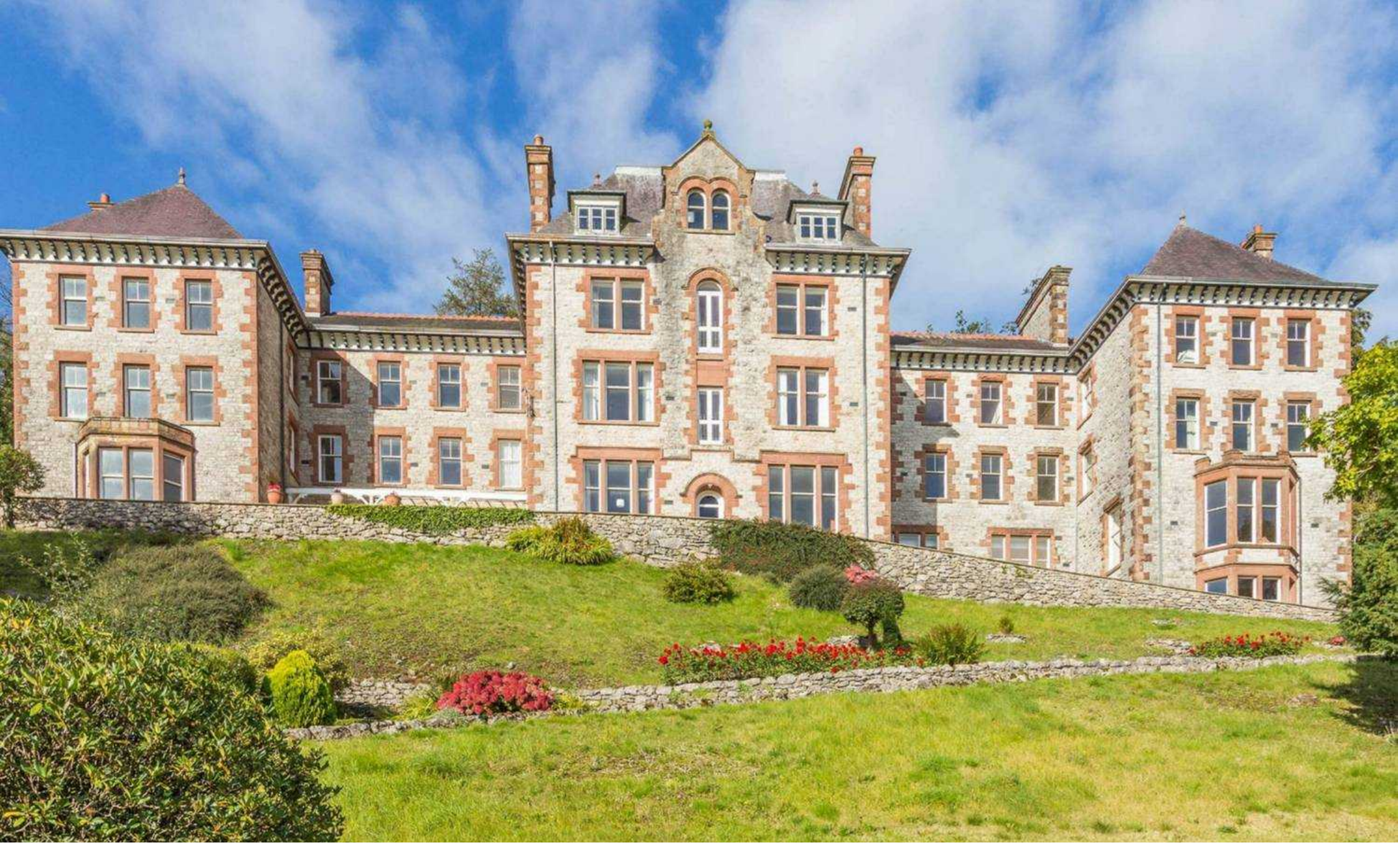
Mulberry, 8 Hazelwood Court, Lindale Road £389,000