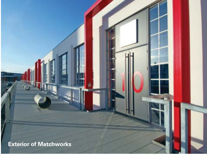
Exterior of Matchworks