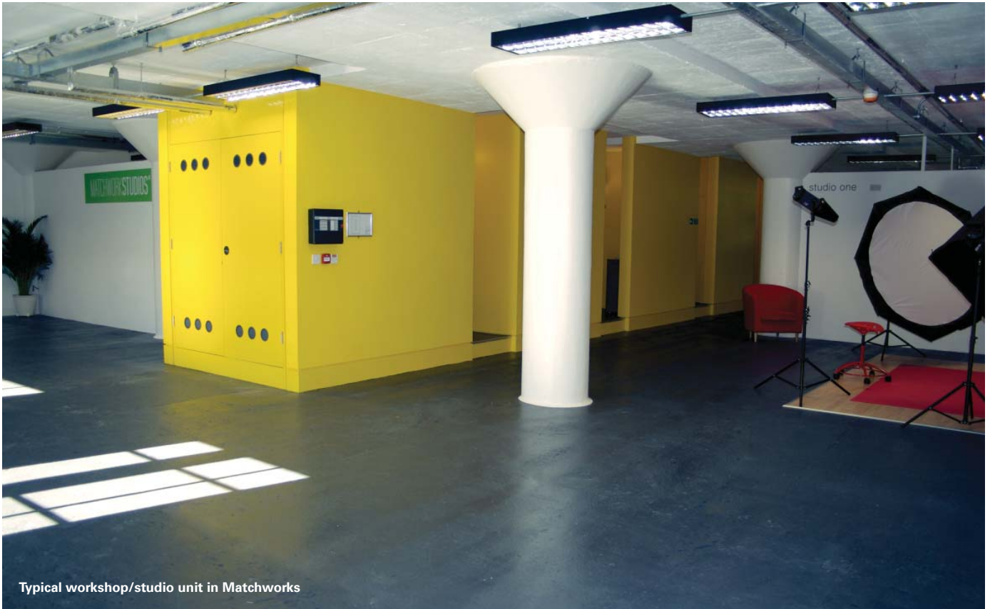
Typical workshop/studio unit in Matchworks