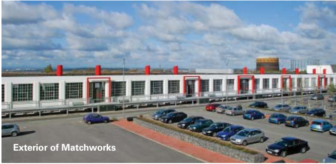
Exterior of Matchworks