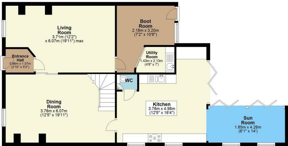
Ground Floor Approx. 88.6 sq. metres (953.7 sq. feet)