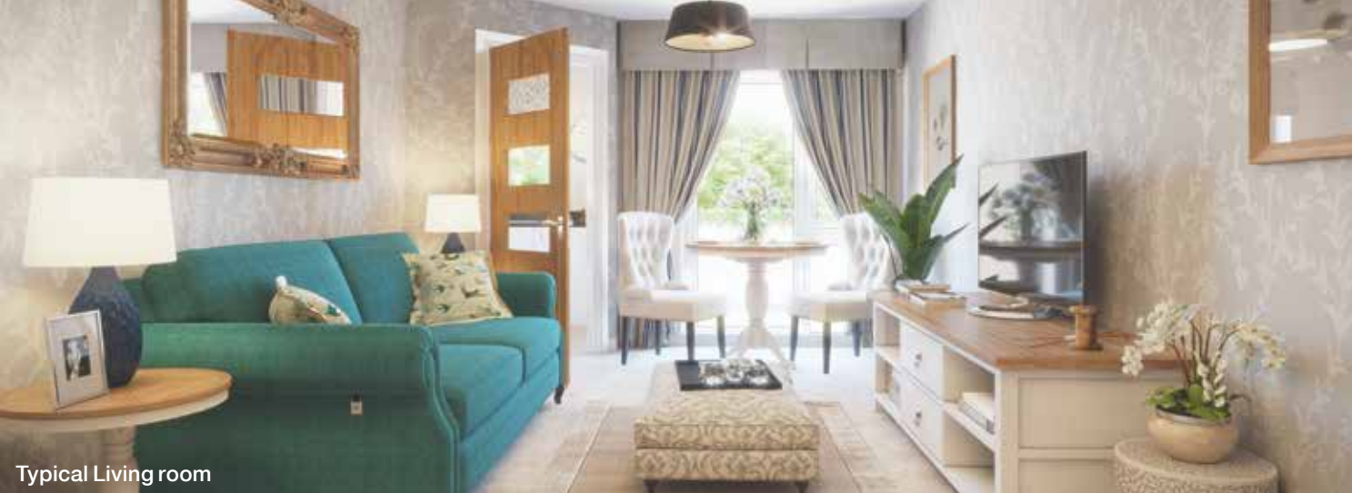
Typical Living room

“ Everything is new, so I don't have to worry about appliances failing or anything else. We no longer have any maintenance worries to think about. ”