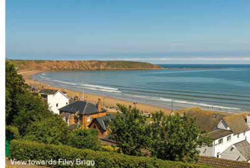
View towards Filey Brigg