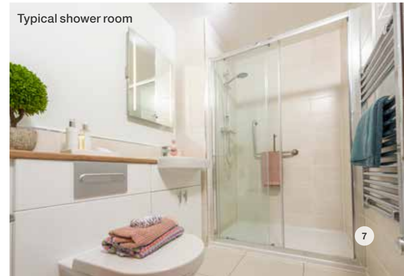
Typical shower room