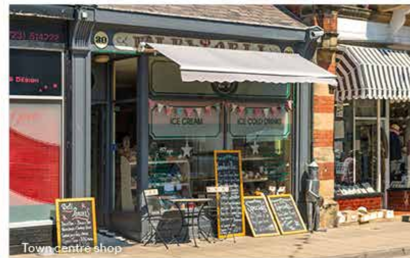
Town centre shop