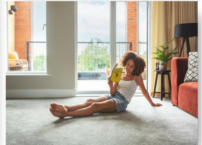
Trent Lane, Nottingham NG2 4DL