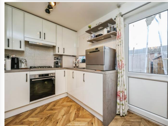
Linden Avenue, Nottingham NG11 8SB