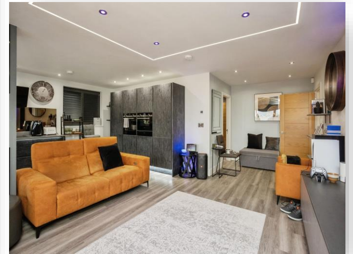
Nicker Hill, Keyworth Nottingham NG12 5ED