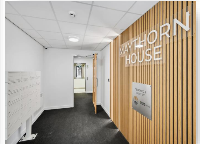
Maythorn House Trent Lane, Nottingham NG2 4DS