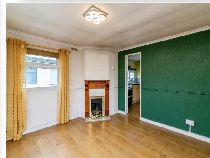
Tollerton Park Tollerton Lane, Tollerton Nottingham NG12 4GD