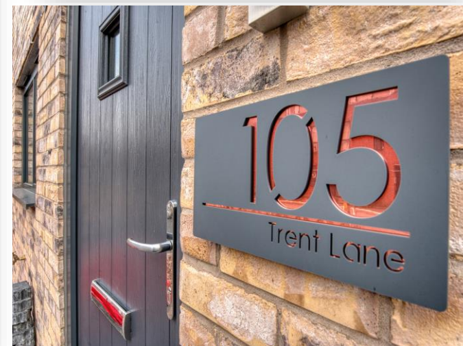
Plot 3 Trent Lane, Nottingham NG2 4DL