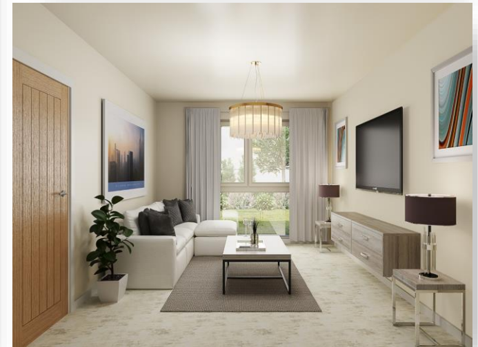
The Old Farmstead Old Main Road, Bulcote Nottingham NG14 5HA