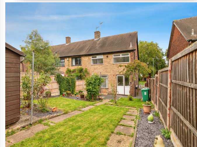
Glapton Lane, Nottingham NG11 8DE