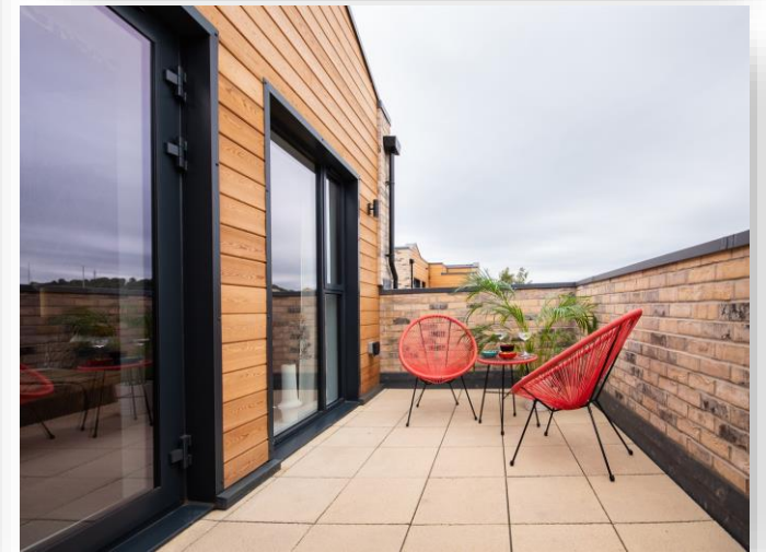
The Wilford Trent Lane, Nottingham NG2 4DL