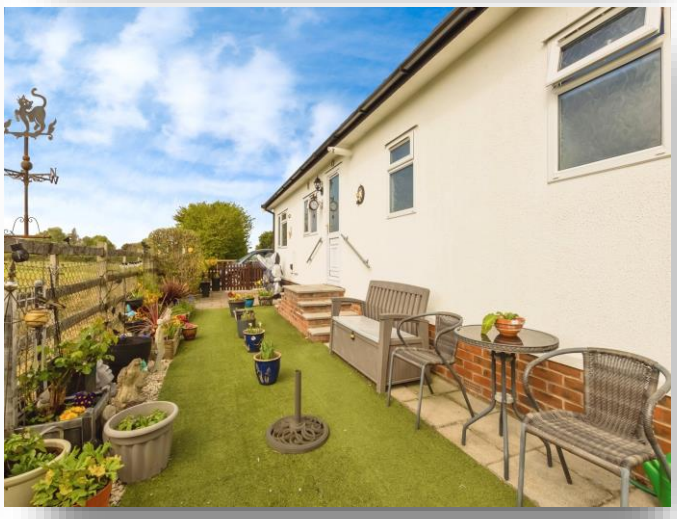
Tollerton Park Tollerton Lane, Tollerton Nottingham NG12 4GD