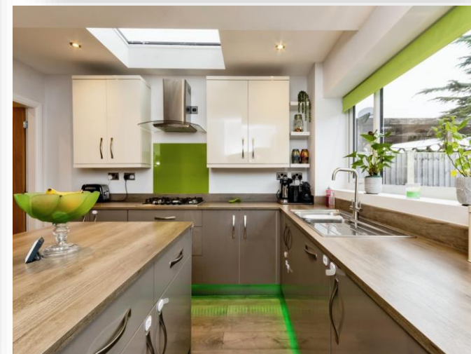
Medina Drive, Tollerton Nottingham NG12 4EP