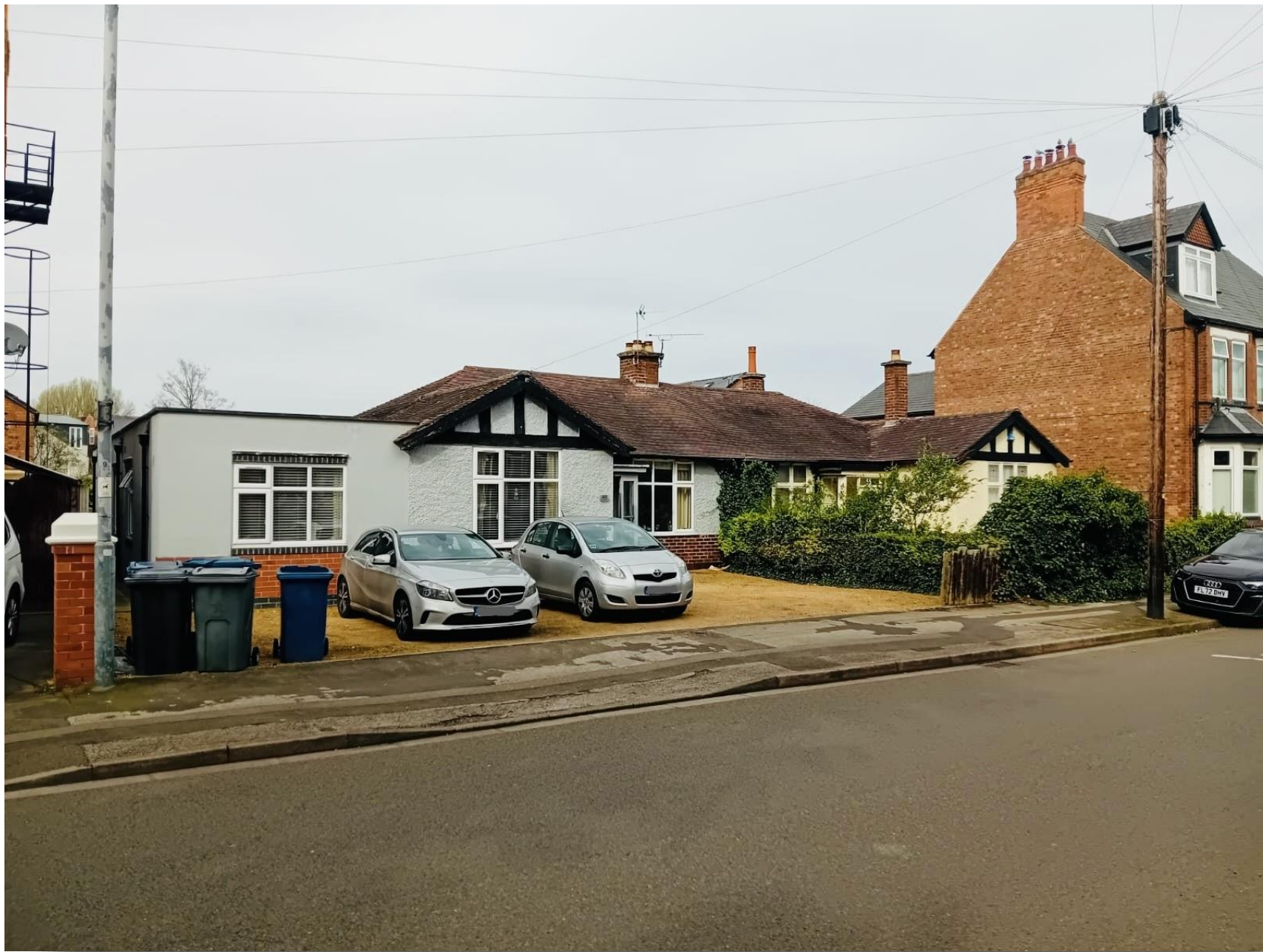
Trent Boulevard, West Bridgford Nottingham NG2 5BB