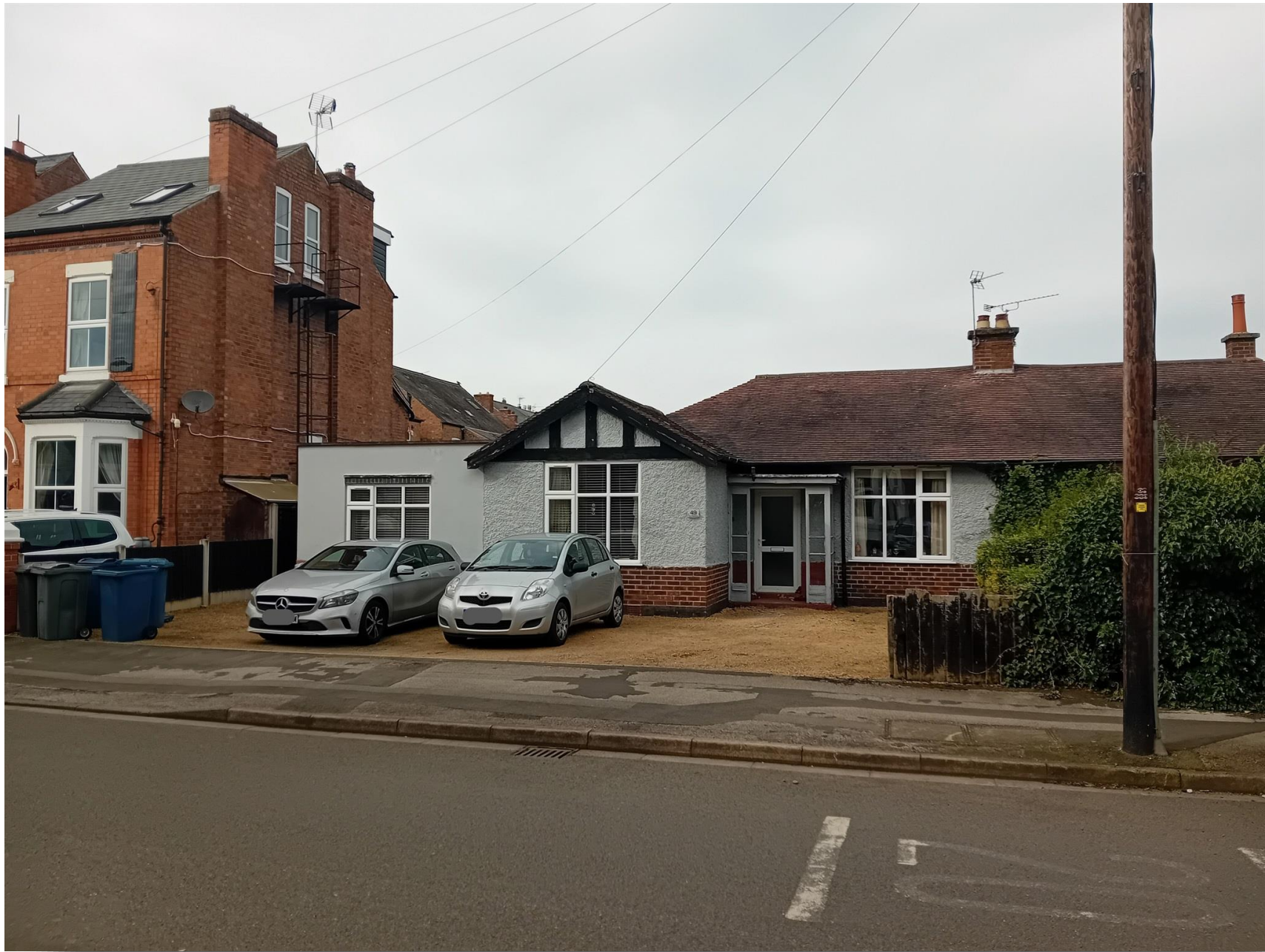
Trent Boulevard, West Bridgford Nottingham NG2 5BB