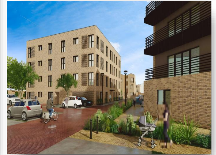
Maythorn House Trent Lane, Nottingham NG2 4DS