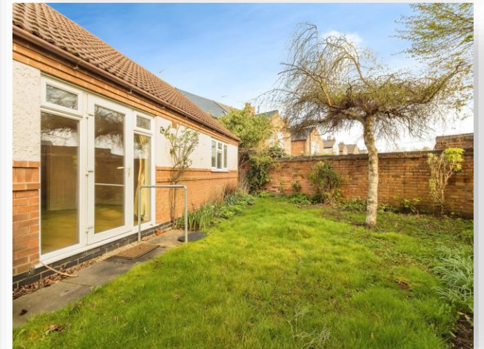
Carlyle Court Carlyle Road, West Bridgford Nottingham NG2 7NQ