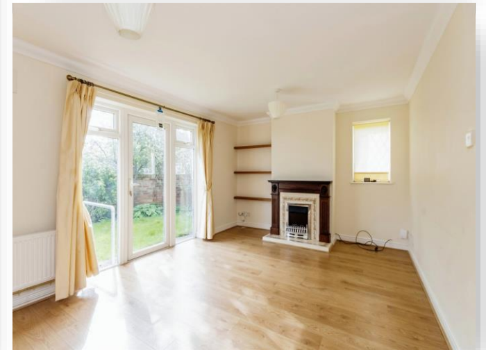
Carlyle Court Carlyle Road, West Bridgford Nottingham NG2 7NQ