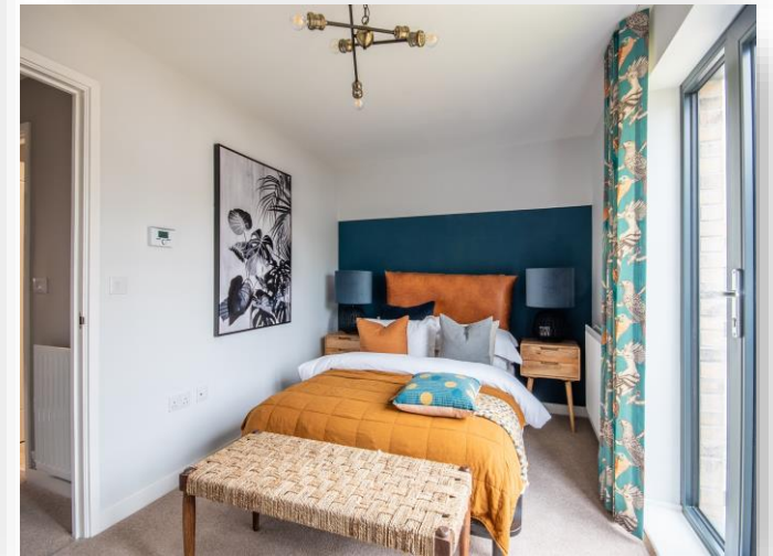
The Sherwood Trent Lane, Nottingham NG2 4DS