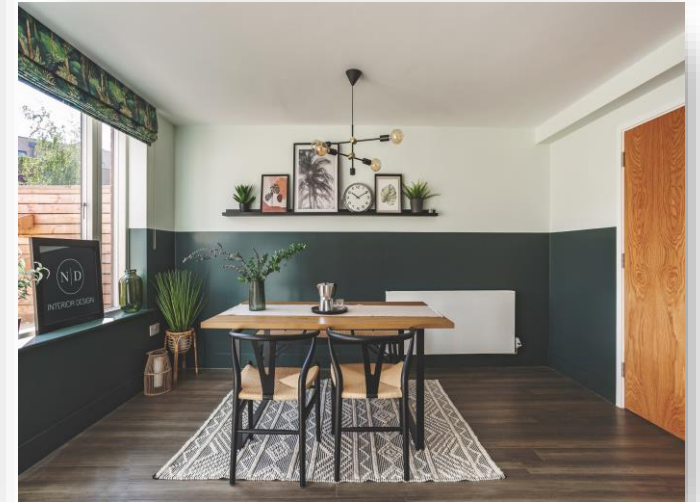
Trent Lane, Nottingham NG2 4DL