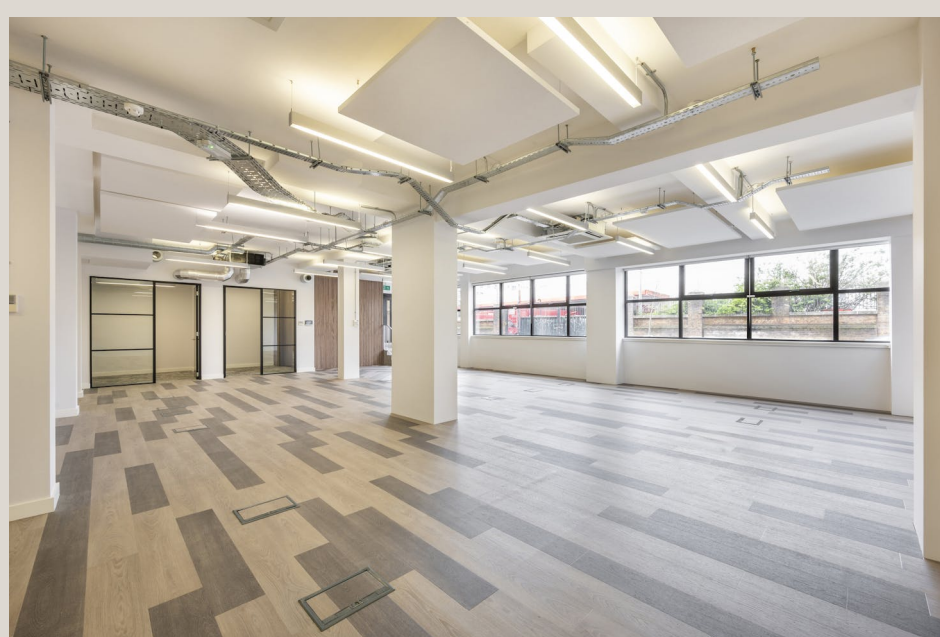
18-20 St. Pancras Way