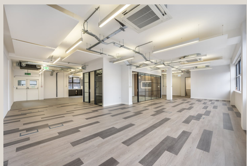
18-20 St. Pancras Way