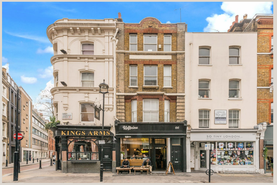
66a Great Titchfield Street