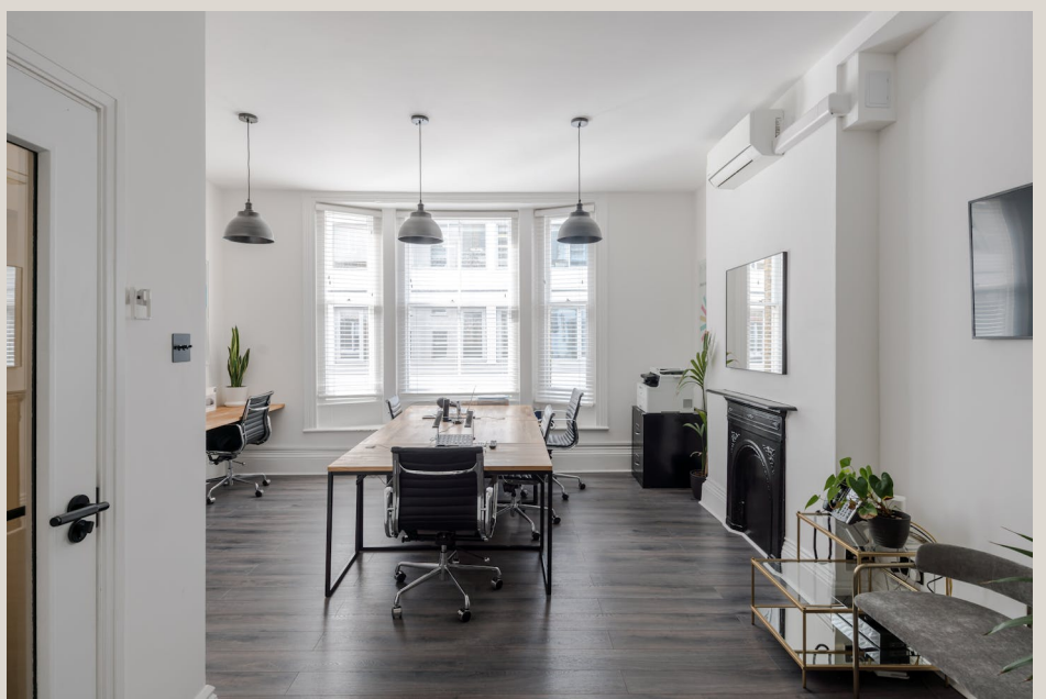
66a Great Titchfield Street