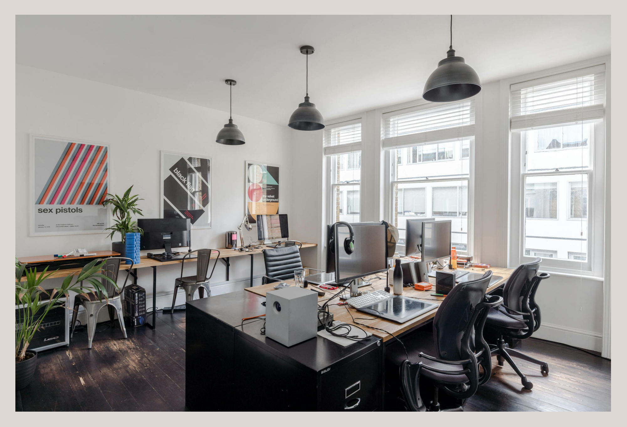
66a Great Titchfield Street