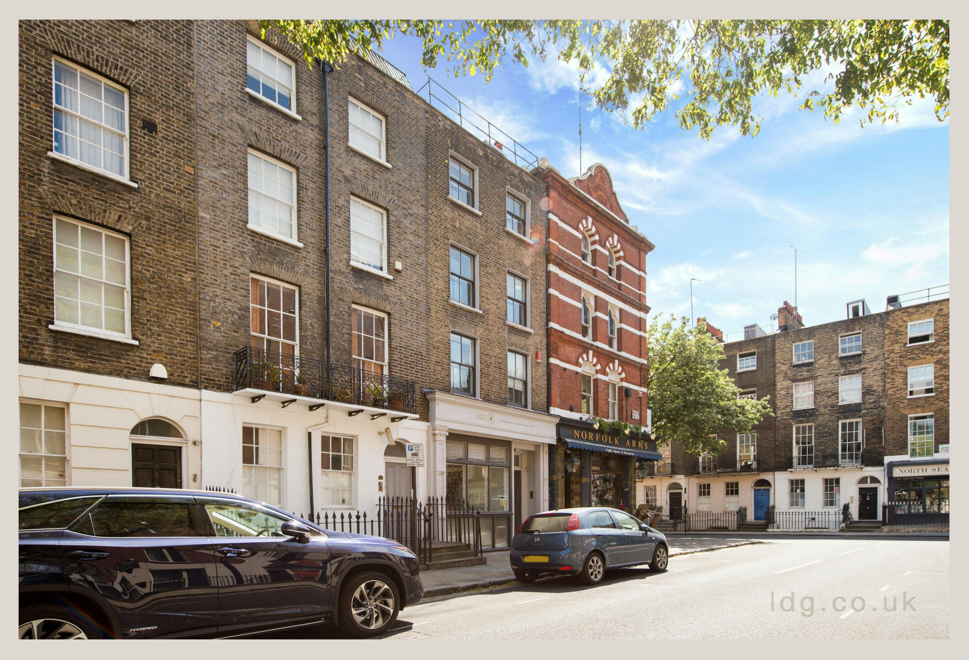
1 Sandwich Street