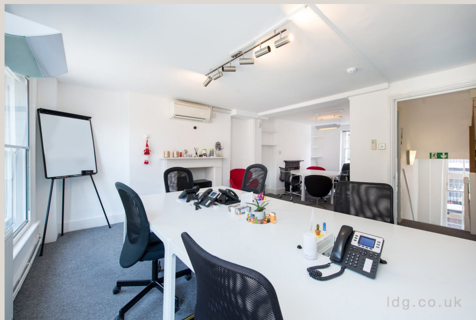
1 Sandwich Street