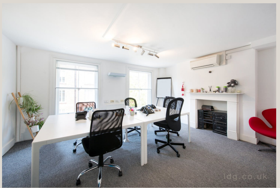
1 Sandwich Street