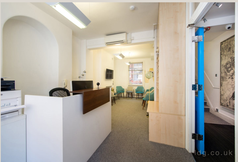
1 Sandwich Street