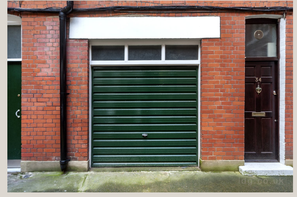
1 Sandwich Street