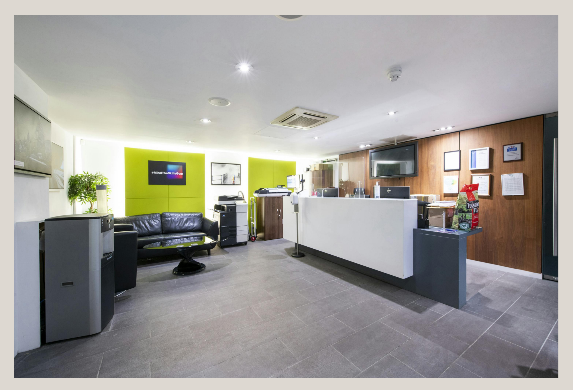
2-5 Stedham Place