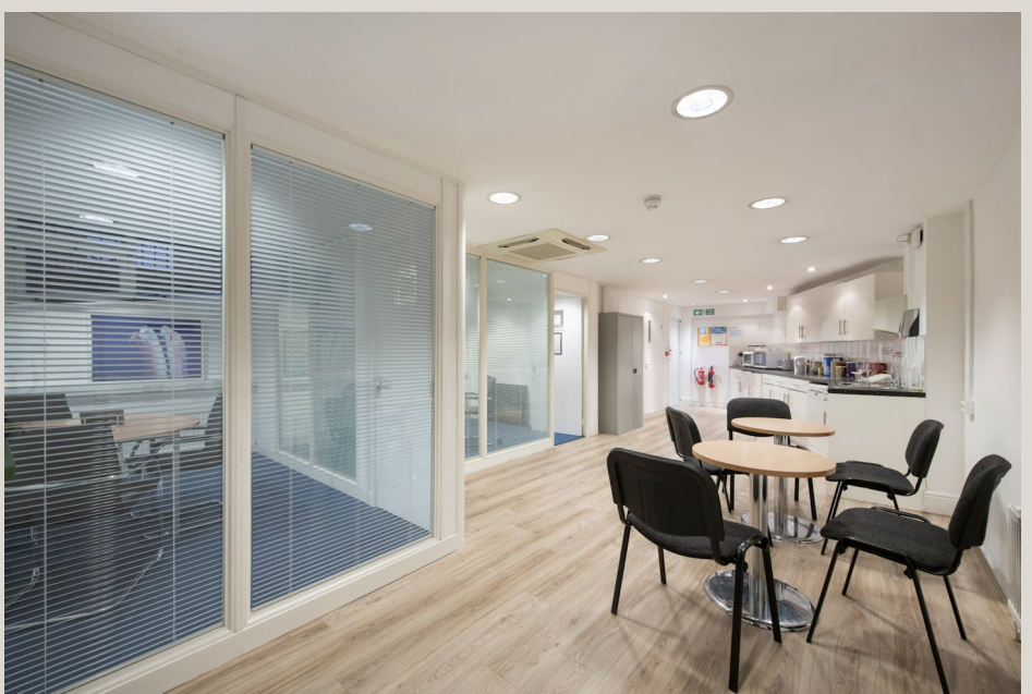
2-5 Stedham Place