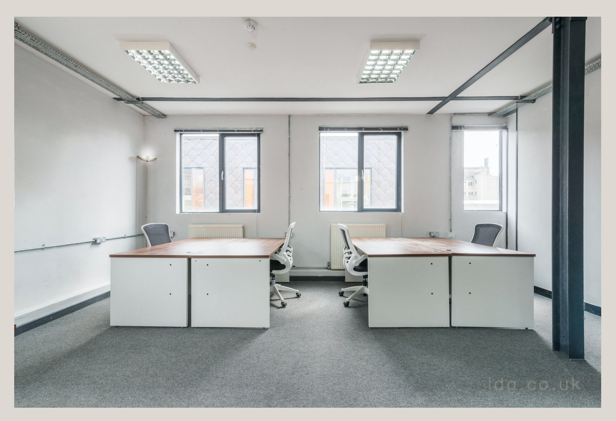
25-28 Field Street