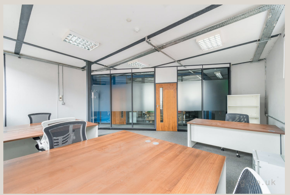
25-28 Field Street