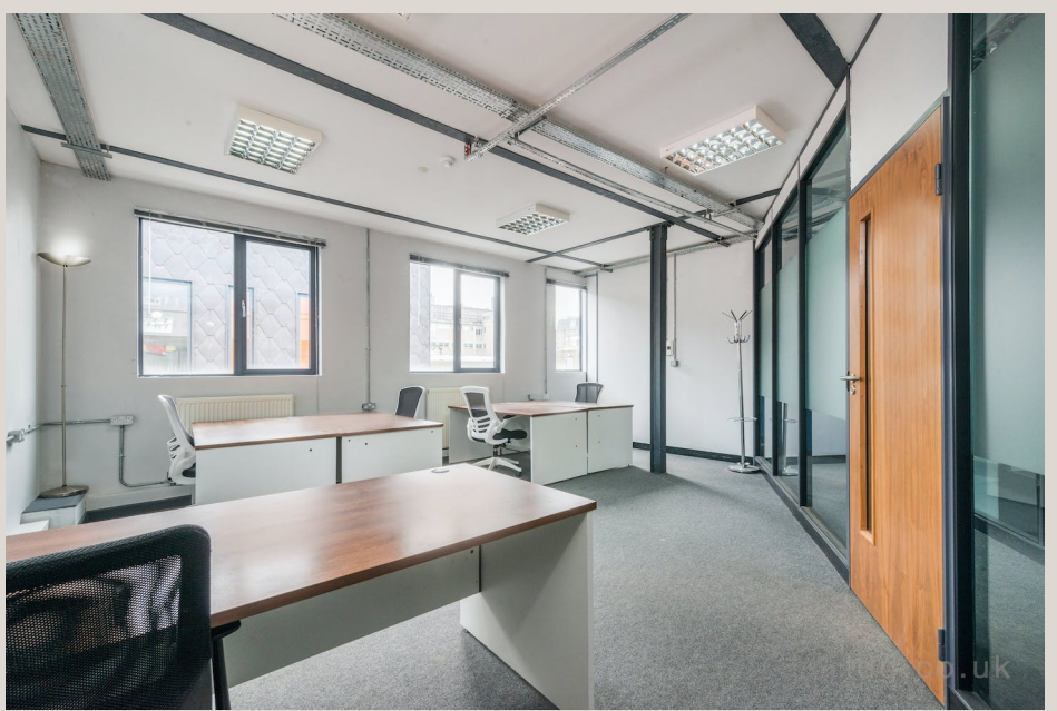
25-28 Field Street