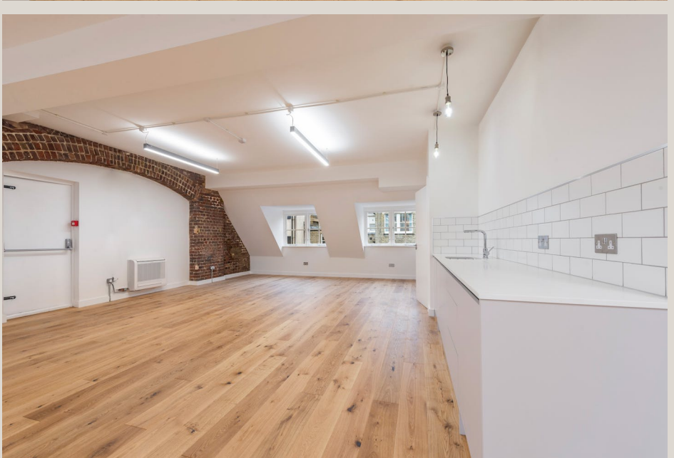
16-17 Little Portland Street