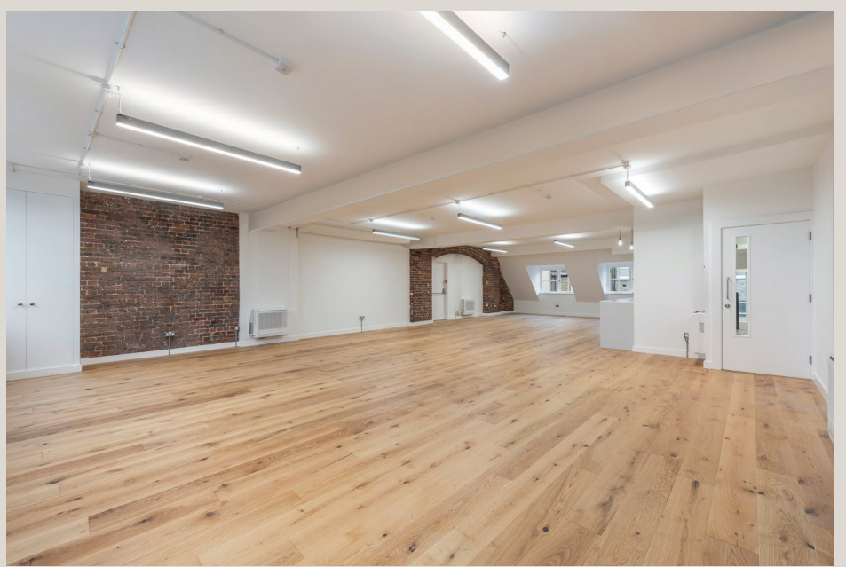
16-17 Little Portland Street