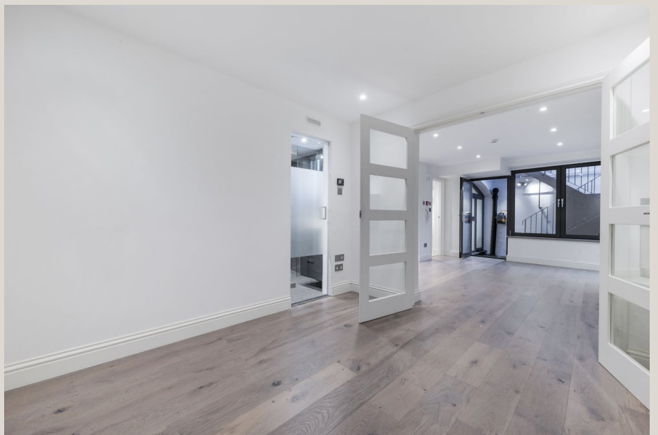
114 Cleveland Street