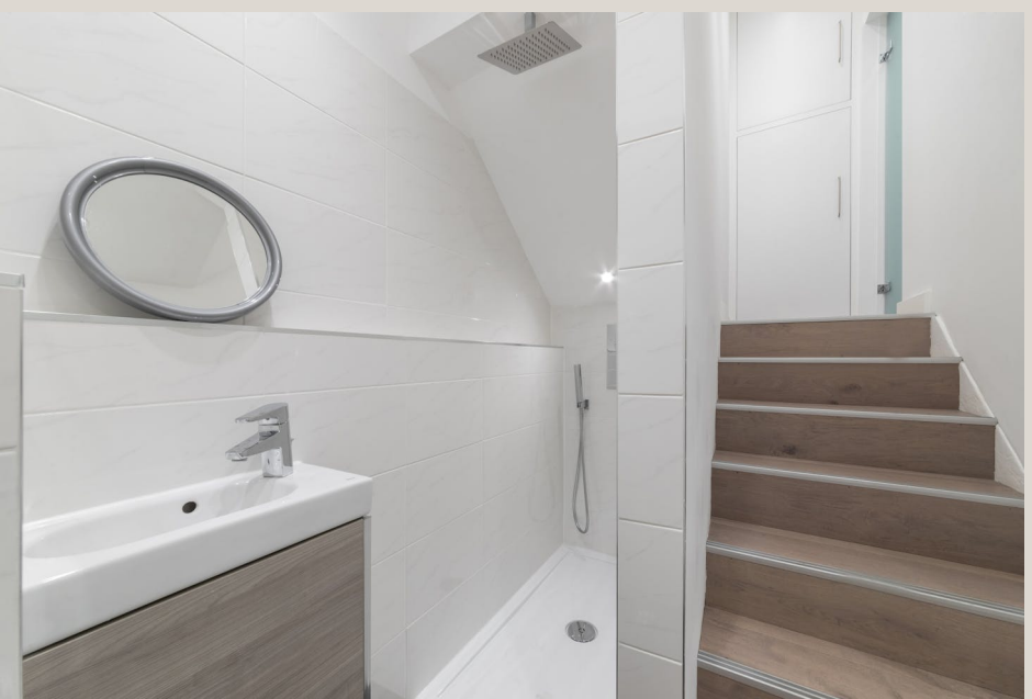
114 Cleveland Street