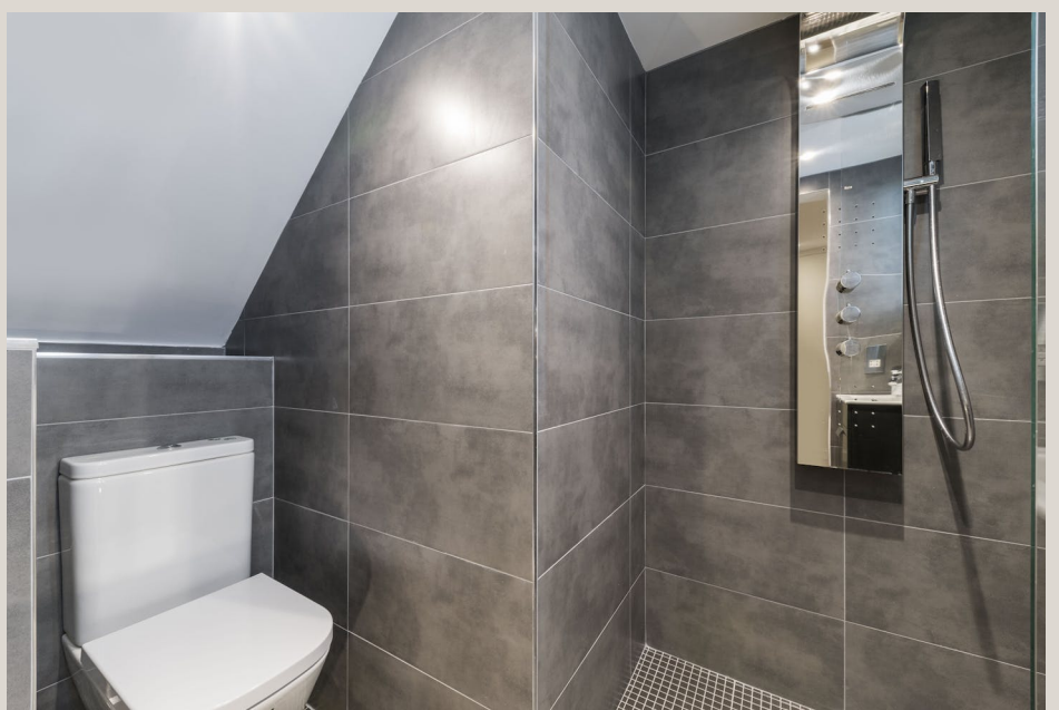
114 Cleveland Street