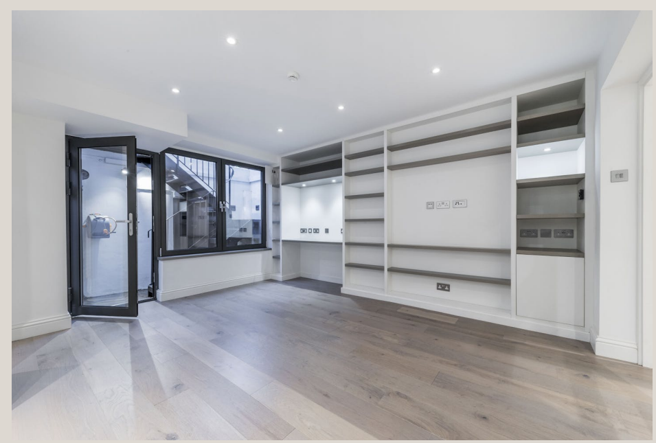
114 Cleveland Street