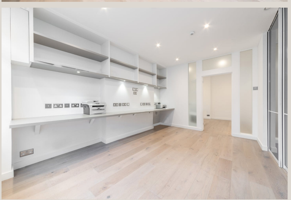
114 Cleveland Street