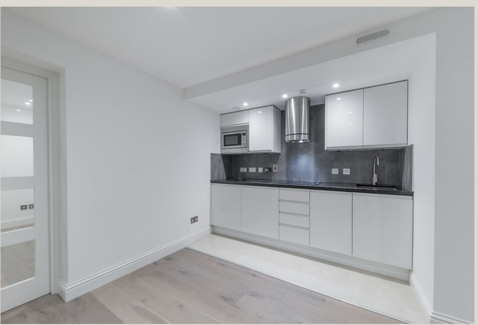
114 Cleveland Street