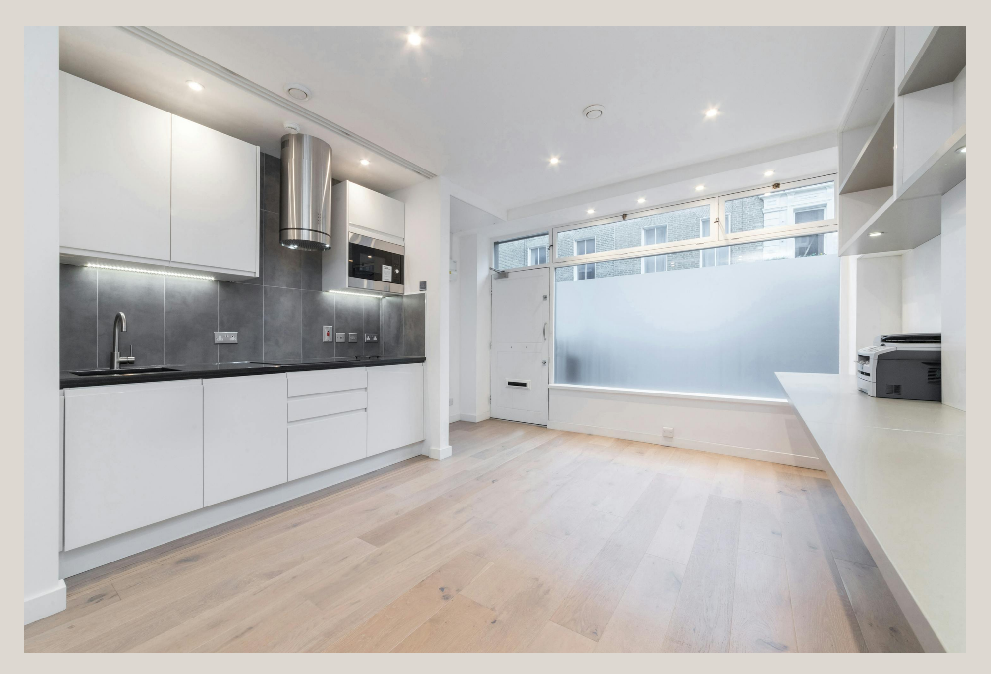
114 Cleveland Street