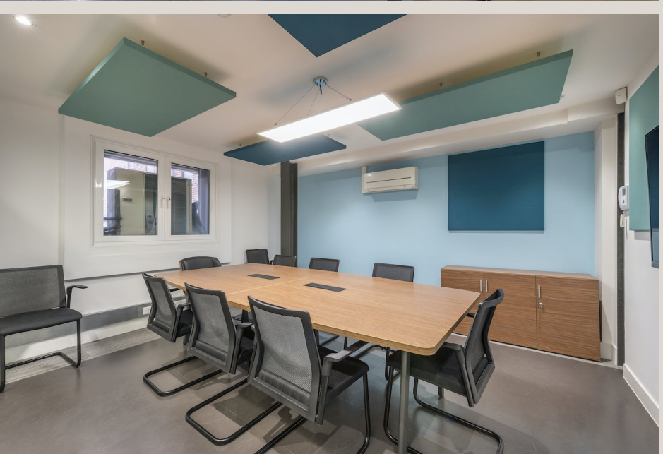
6 Brownlow Mews