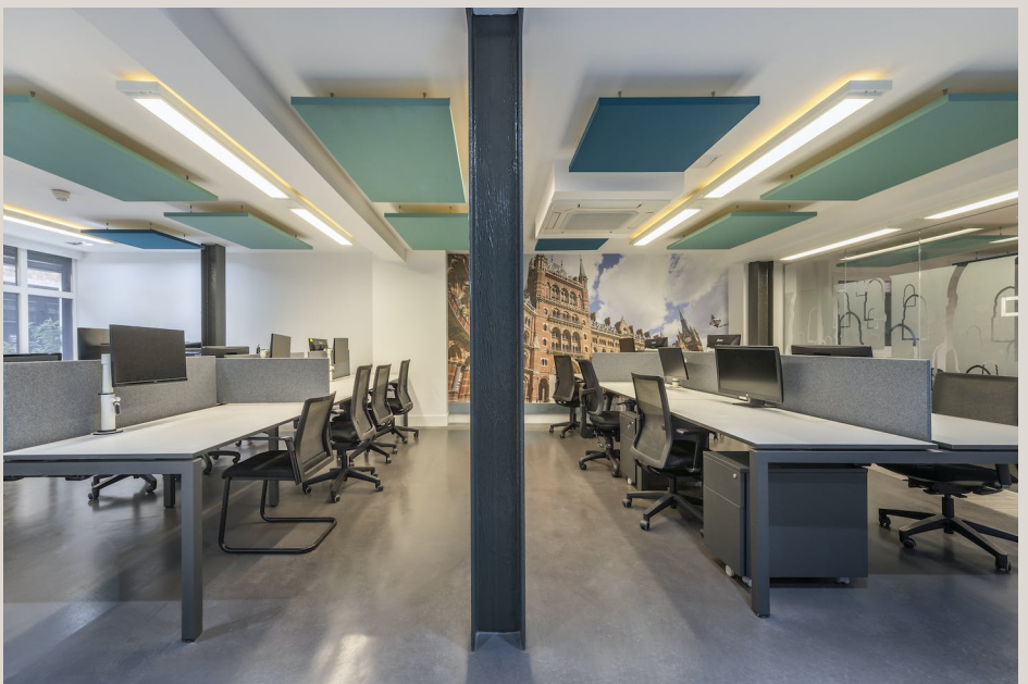
6 Brownlow Mews