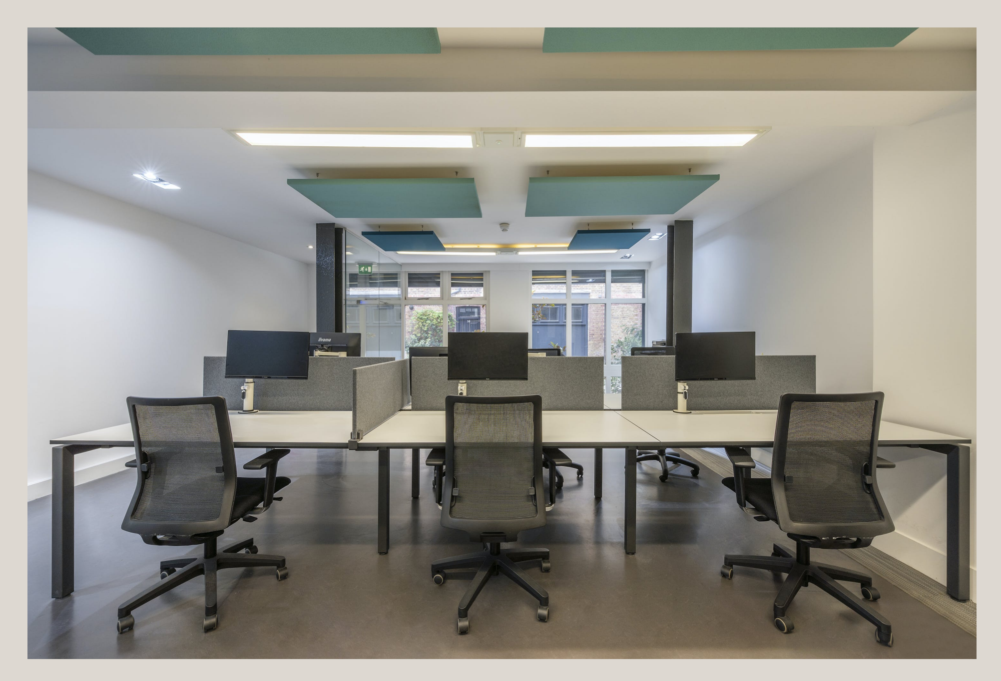
6 Brownlow Mews