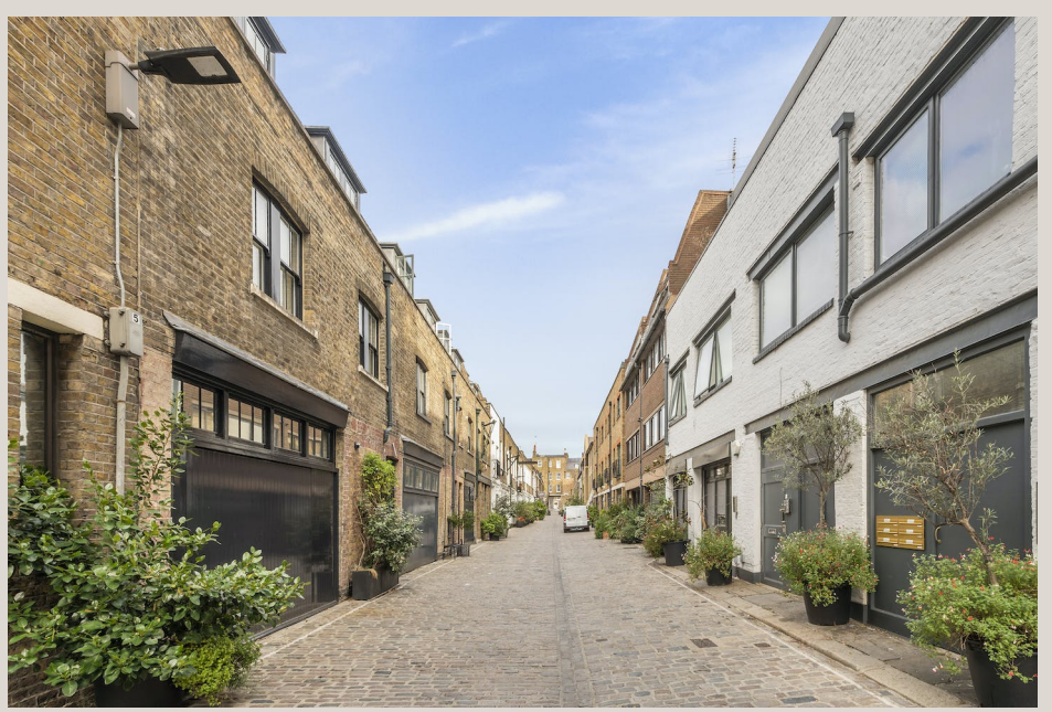
6 Brownlow Mews