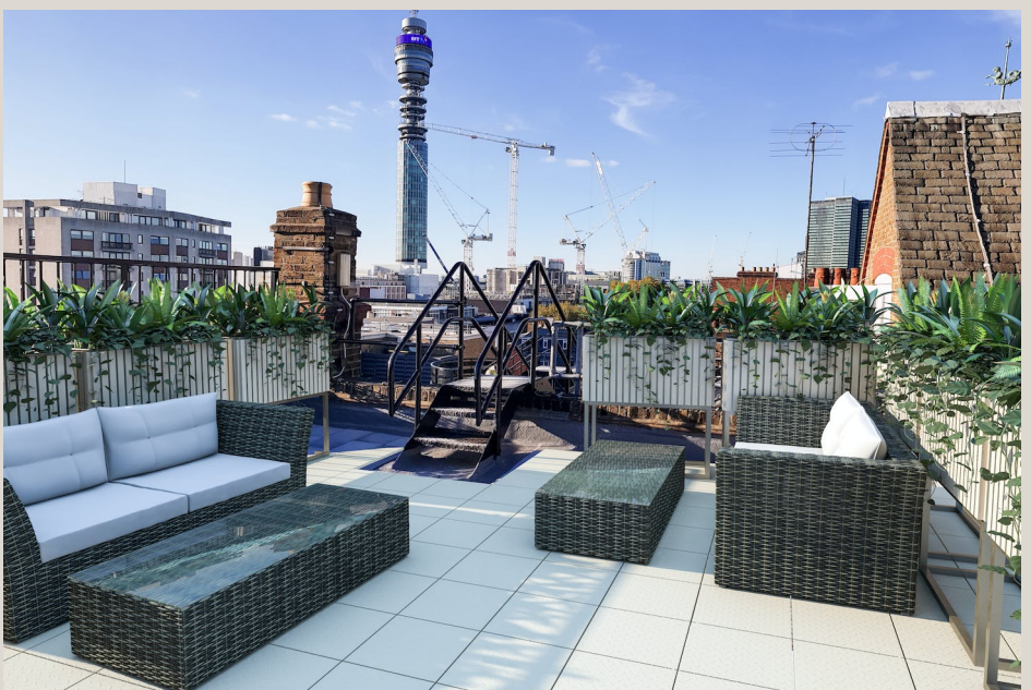
17 Riding House Street