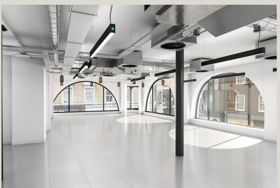
17 Riding House Street