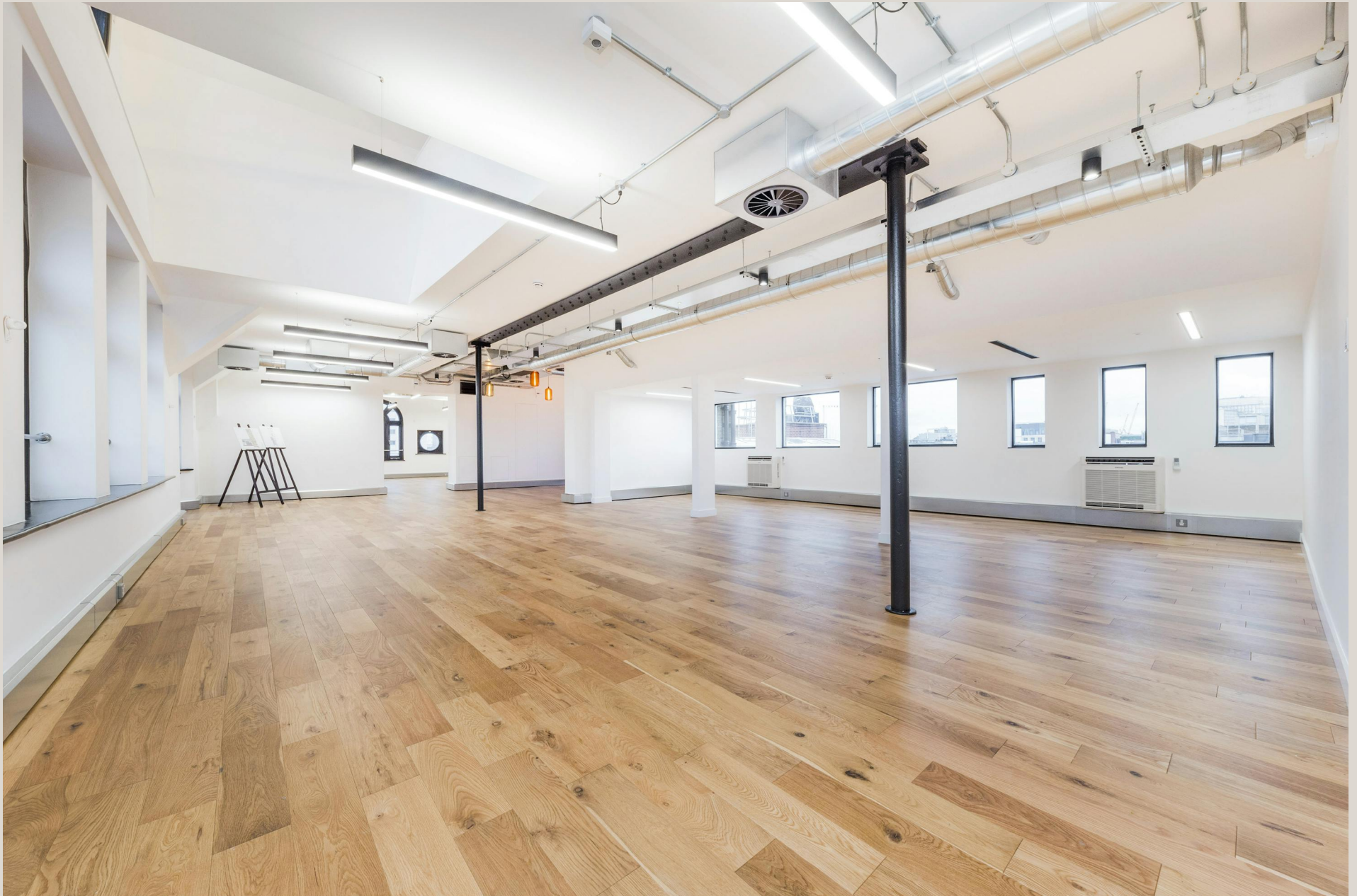
34 Whitfield Street