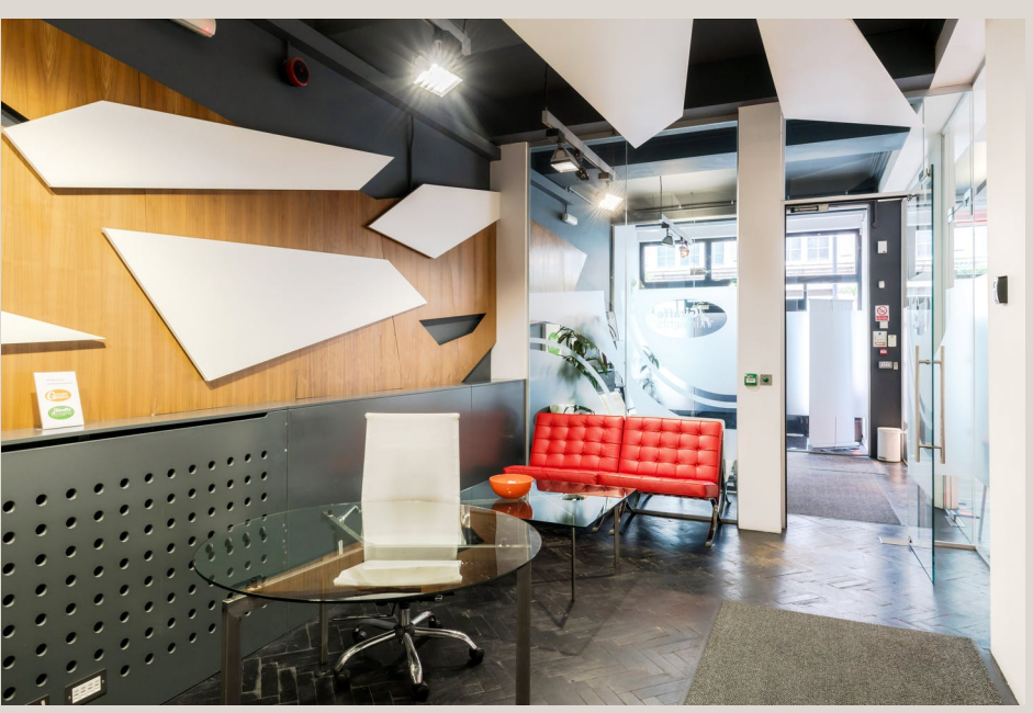
87 New Cavendish Street