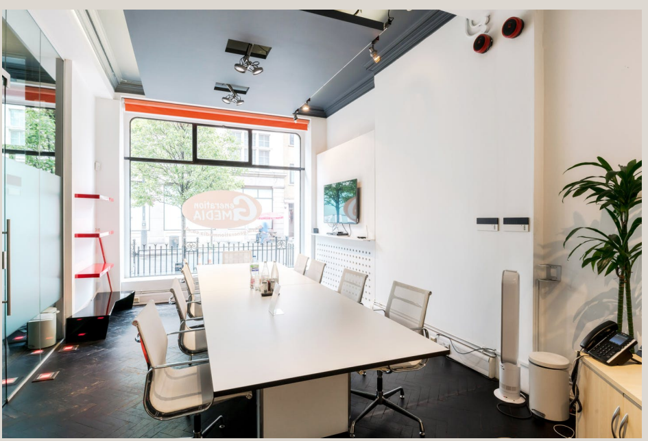
87 New Cavendish Street