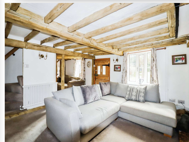
Bramble Cottage Church Road, Bacton Stowmarket IP14 4LN