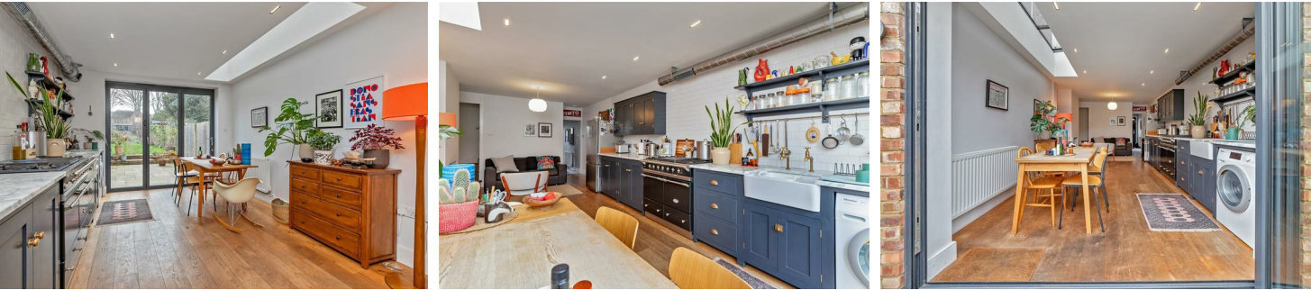
Ground Floor Approx. 441.8 sq. feet

Well presented and extended terraced house which offers the charm of an older property with the modern extended open plan living space as well as a separate sitting room. The main body of the property is a spacious and inviting open plan space with a wood burning stove, modern kitchen area having marble worktops, room for a dining table and a family seating area with bi folds opening onto the garden. On the first floor are two good size double bedrooms and a large modern bathroom with separate bath and shower, a touch of luxury. Outside the garden is long and south facing with a patio area level lawn, timber shed and greenhouse. Castle Road is a popular residential road situated to the east of St Albans City Centre within close proximity to many local amenities including Morrisons supermarket, restaurants, parks, desirable local schools and the mainline station, linking St. Albans to London, St Pancras in just under 30 minutes.