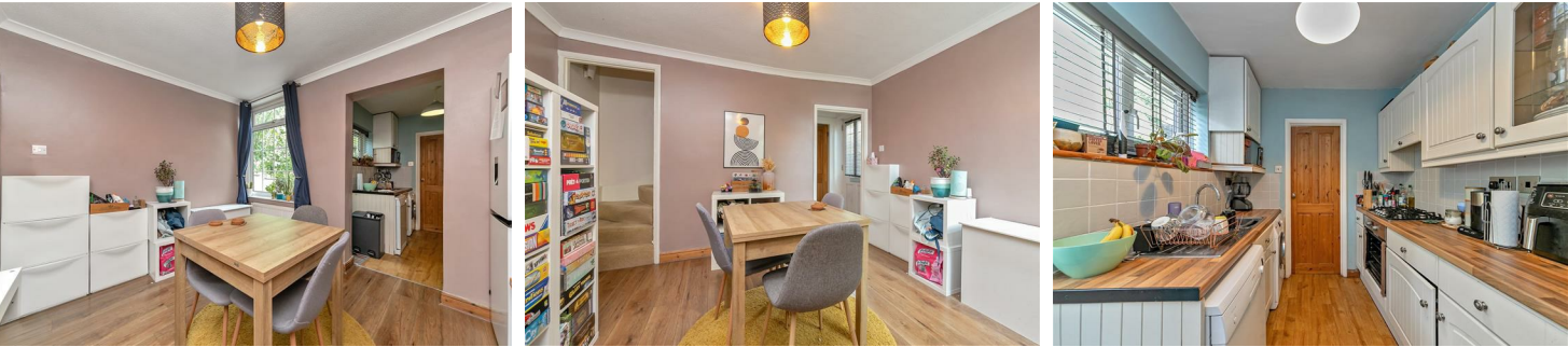
Ground Floor Approx. 39.9 sq. metres (429.1 sq. feet)

A conveniently located two bedroom semi detached cottage set in a popular central conservation area location within walking distance of the City centre opposite Victoria Park and adjacent to allotments. The ground floor accommodation includes a lounge with feature fireplace, separate dining room, kitchen and bathroom. Upstairs accommodation comprises of two double bedrooms. The property has scope to extend and convert the loft, subject to necessary permissions. The property is offered for sale with no upper chain. Situated in close proximity to the city centre, residents will enjoy easy access to a variety of shops, restaurants, and local amenities. The vibrant community of St Albans is known for its rich history and beautiful parks, making it an ideal location for families and professionals alike.