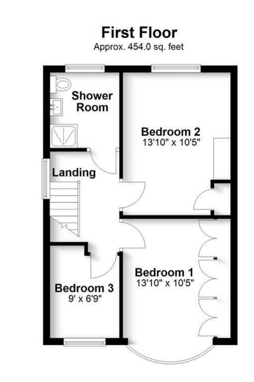
Cassidy & Tate have taken all reasonable steps to ensure the accuracy of the details supplied in our marketing material however, details are provided as a guide only and we advise prospective purchasers to confirm details upon inspection of the property Cassidy & Tate will not be held liable for any costs which are incurred as a result of discrepancies