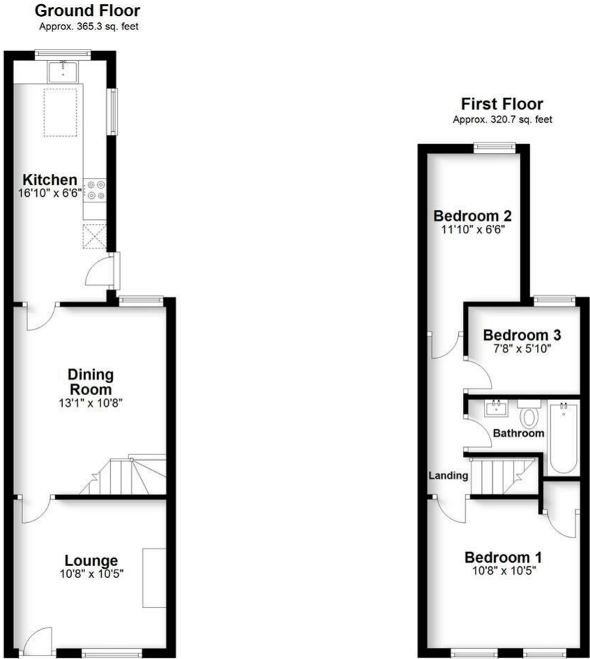
Total area: approx. 686.0 sq. feet Produced for Cassidy & Tate Estate Agents. For guidance purposes, not to scale. Plan produced using PlanUp.