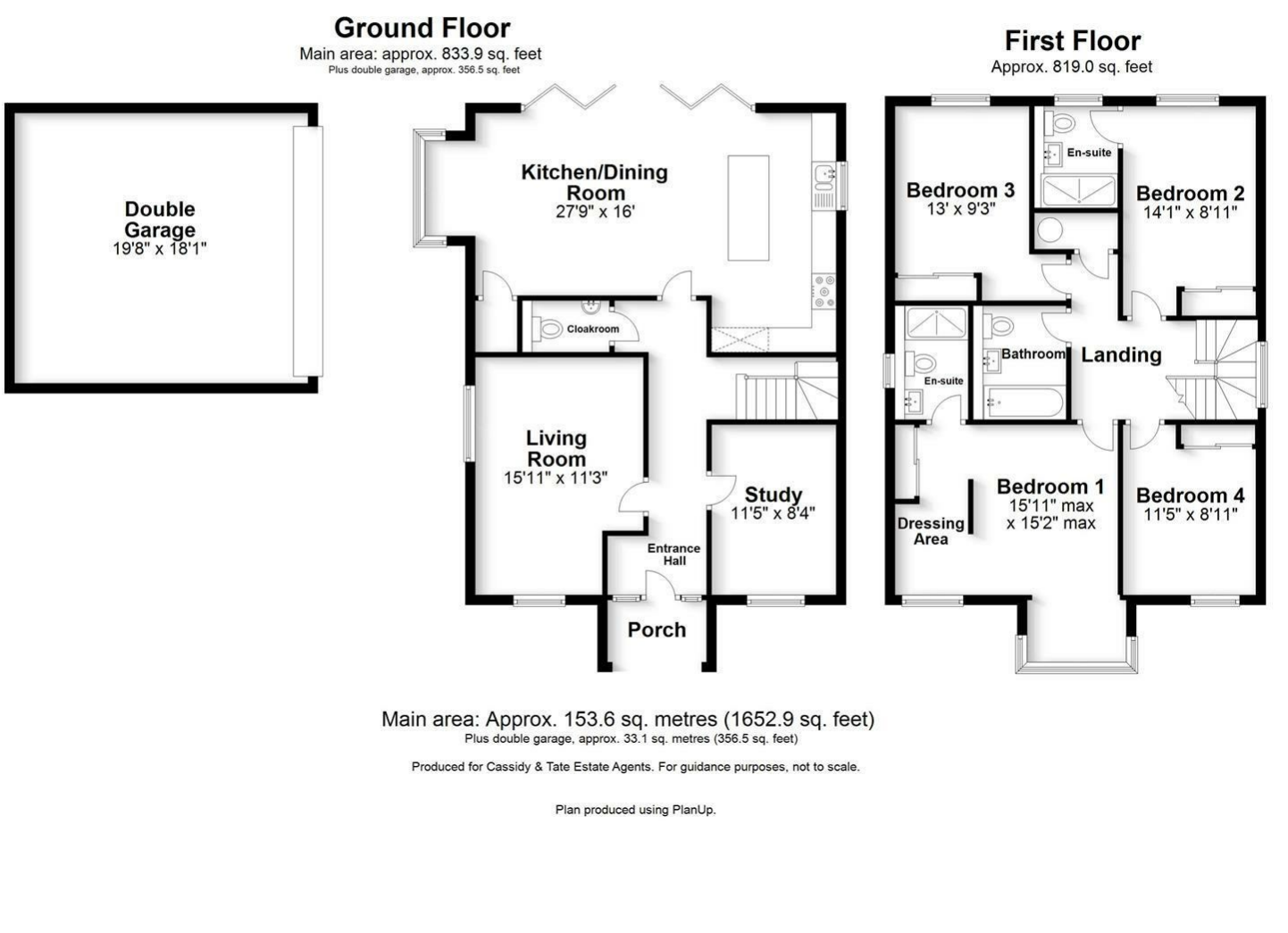
Cassidy & Tate have taken all reasonable steps to ensure the accuracy of the details supplied in our marketing material however, details are provided as a guide only and we advise prospective purchasers to confirm details upon inspection of the property Cassidy & Tate will not be held liable for any costs which are incurred as a result of discrepancies