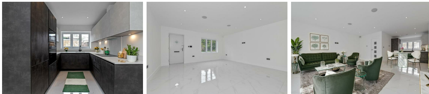
Ground Floor Approx. 513.0 sq. feet

Welcome to Chapel Croft. This new build development of six beautiful chain free homes located in the charming Chipperfield village. These properties boasts large downstairs open plan reception rooms, perfect for entertaining guests or simply relaxing with your loved ones. With four bedrooms and four bathrooms, there is ample space for the whole family to enjoy. Built in 2024 by the renowned local developer McGowan Group, this property offers modern amenities and a fresh, contemporary design that is sure to impress. The sleek attention to detail make these homes a true gem in the heart of a picturesque village. Situated in a desirable location, this property provides a perfect blend of tranquillity and convenience. Whether you're looking to unwind in the peaceful surroundings or explore the nearby amenities, Chapel Croft offers the best of both worlds. Each property comes with its own allocated parking bays for two cars to the rear. Don't miss out on the opportunity to make this new build property your own. Contact us today to arrange a viewing and take the first step towards owning your dream home in Chipperfield.