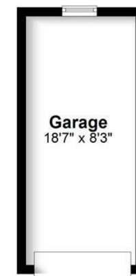
Ground Floor Main area: approx. 553.8 sq. feet Plus garage, approx. 153.3 sq. feet