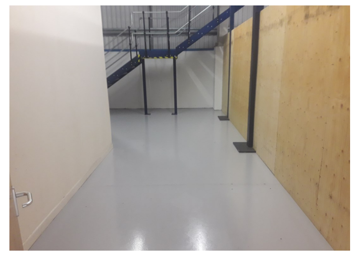
Stairs to Mezzanine