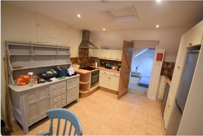
First Floor Kitchen/Dining Room