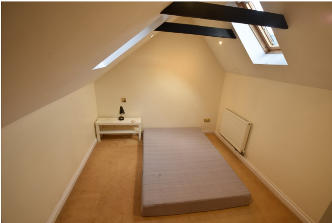
First Floor Bedroom