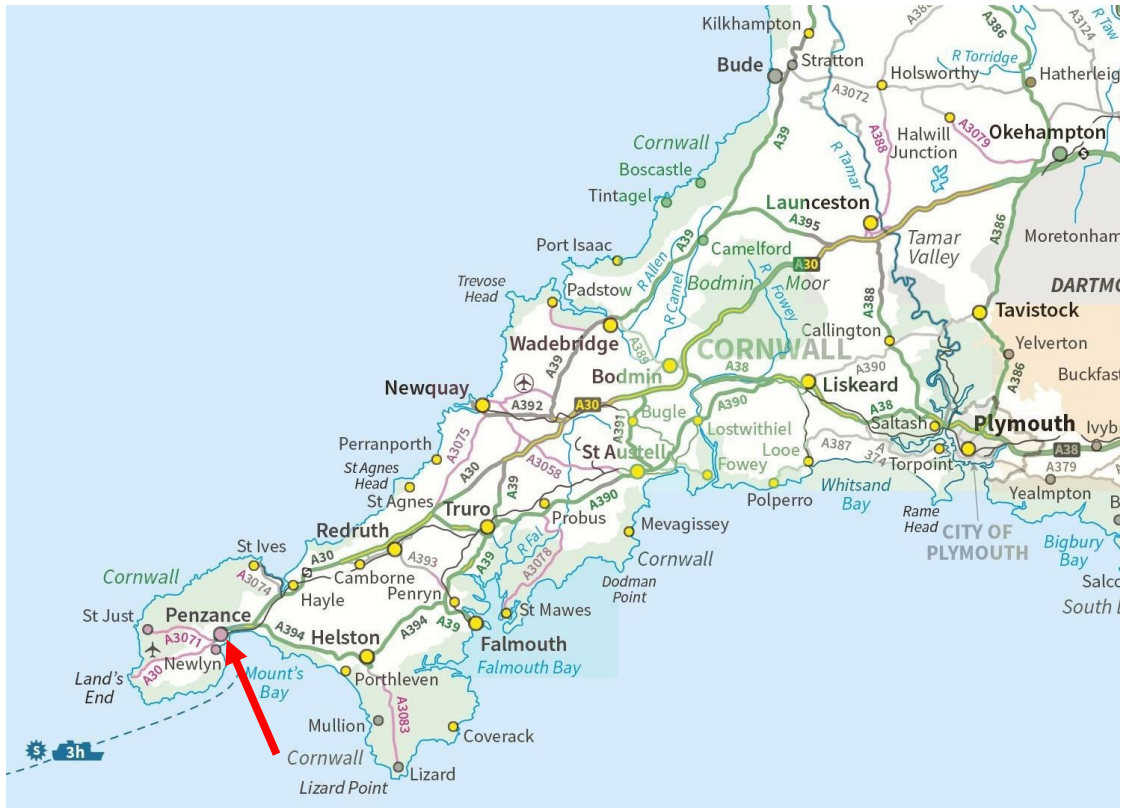
Map of Cornwall locating Penzance with red arrow

Cornwall Office: Trenoweth, Troubridge Road, Helston, Cornwall, TR13 8DQ