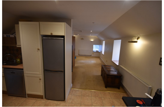
First Floor Kitchen/Dining Room/Living Room