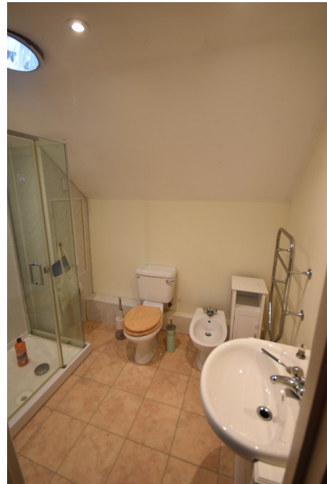
First Floor Shower Room