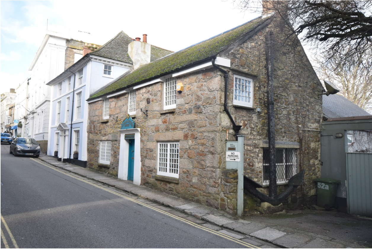
External Elevation with Anchor Feature