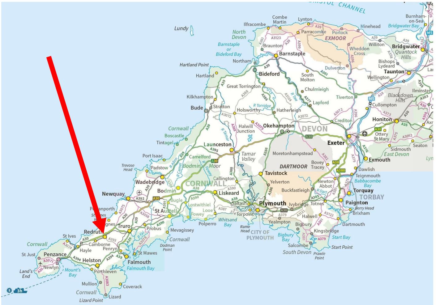
Red arrow locating Redruth, Cornwall