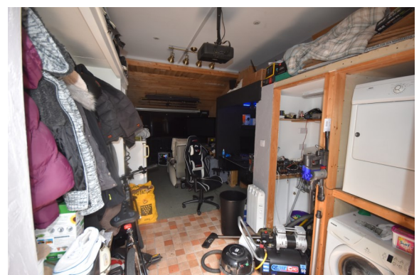
Utility / Garage

Cornwall Office: Trenoweth, Troubridge Road, Helston, Cornwall, TR13 8DQ