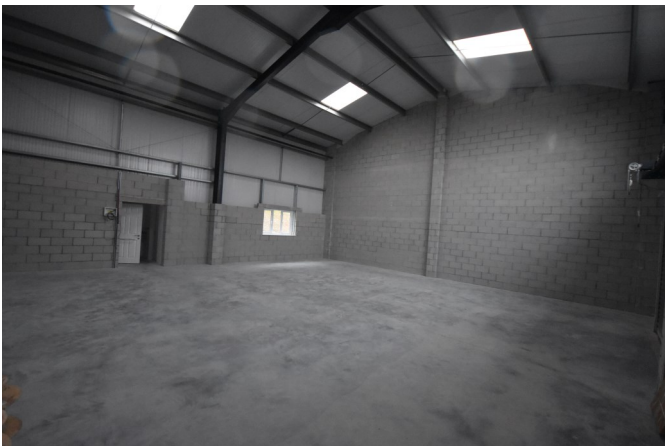
Industrial area rear