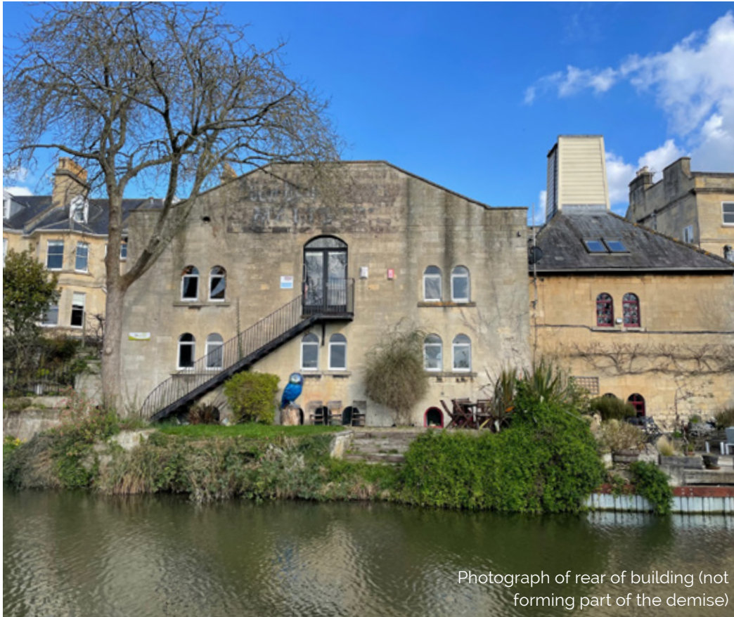
Photograph of rear of building (not forming part of the demise)