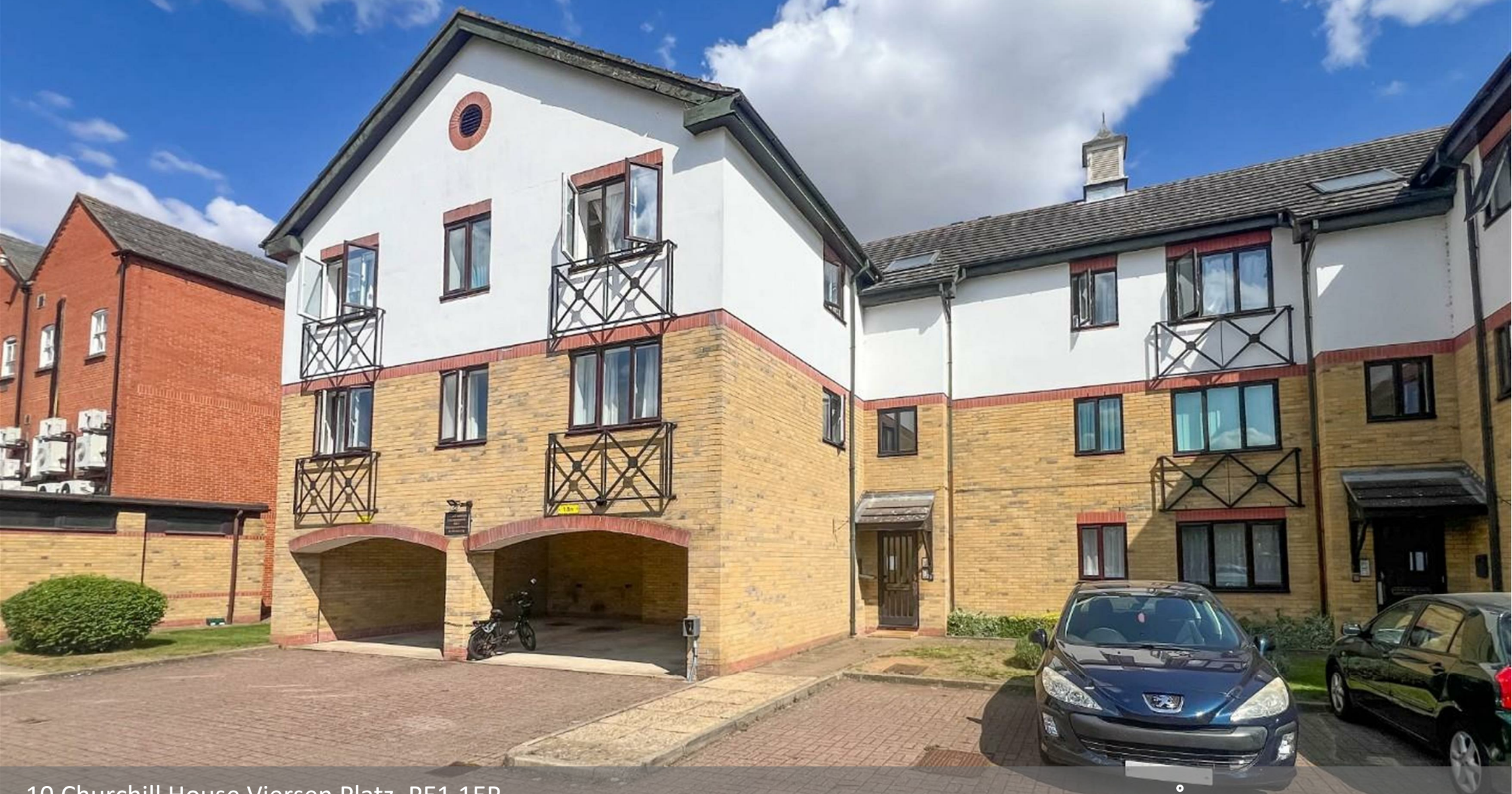
10 Churchill House Viersen Platz, PE1 1EP Offers over £100,000